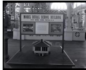
Panama-Pacific International Exposition, 1915

507 $a Scale: 1/5"=1'-0", 1 : 60 of the original building